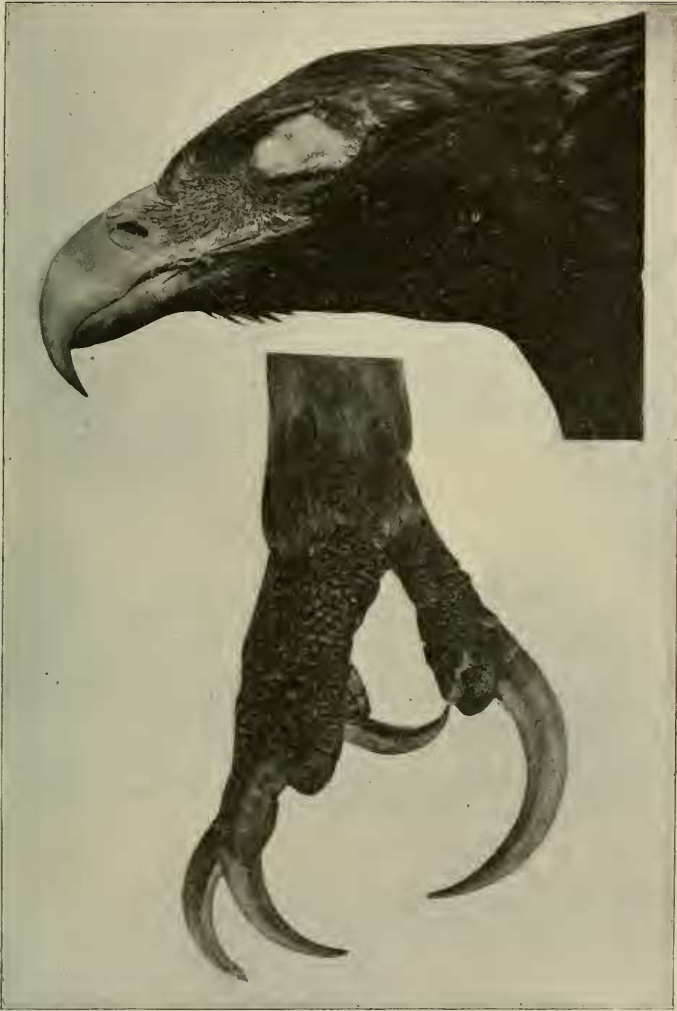
Aquila chrysaetos , Golden Eagle.